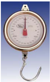
Hanging Dial Scale Available 60-200 Lb.