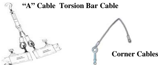
"A" Cable Torsion Bar Cable